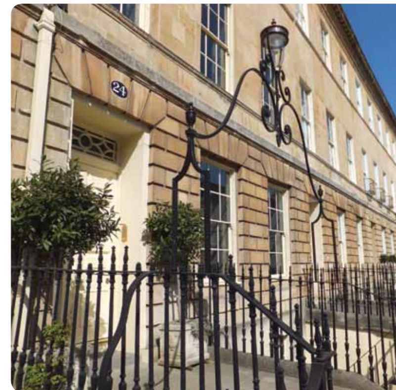
Restored historically correct overthrows and lights

Also reported last year was the Fund's work with The Pulteney Estate Residents' Association to restore historically correct overthrows and lights above Georgian gateways. The Association can now offer residents the execution of works to a standard design at about half the cost of an individual scheme. The scheme has been a great success, with 10 'new' overthrows now adorning the estate and road that Nicholas Pevsner described as being amongst 'England's finest formal streets'.