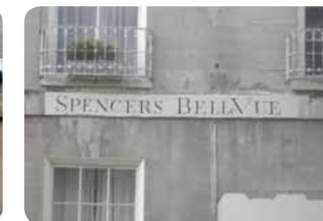
Incised street names, before and after restoration