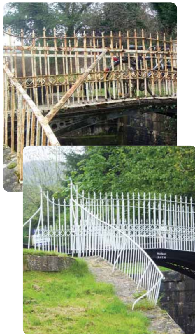
Stothert canal bridge, before and after restoration

Last year's newsletter reported the Fund's support of a British Waterways lottery bid to restore 'at risk' grade II listed canal footbridges and a Pumphouse Chimney at Widcombe. A year later, funding has been secured, and works completed. The early nineteenth century iron bridges were reputedly the first two structures manufactured by the Stothert (later Stothert and Pitt) foundry, established 1785 in Bath. The Wash House Bridge in particular required serious restoration and was removed from site and thoroughly made over by specialists Dorothea Restorations, Bristol. The work was officially opened by British Waterways and the Mayor of Bath in July 2011, and subsequently received an Institute of Civil Engineers award. It is alarming to think that without timely intervention these unique structures may have been lost.