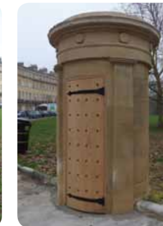
The Watchman's Box, before and after restoration

A charming characteristic of Bath's streets are the incised street names, carved into the stone string courses and displaying the care and craftsmanship which pervades the Georgian city. Sadly, many names have eroded or been defaced, and often replaced by modern street signs. The Fund has now faithfully restored 6 incised and 2 painted signs on 7 city streets. This work is especially rewarding where it reverses unsympathetic alterations, such as the removal of a plastic downpipe at Spencer's Belle Vue, and the piecing in of a lost letter 'e' at Charles Street.